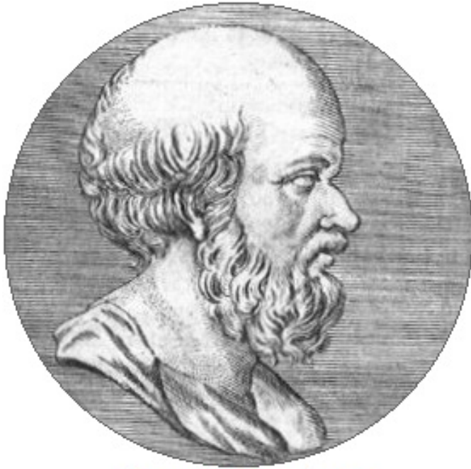
Portrait of Eratosthenes