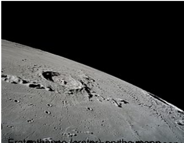
Eratosthenes (crater) on the Moon. Eratosthenes crater is a lunar crater in the eastern part of the Eastern Sea.