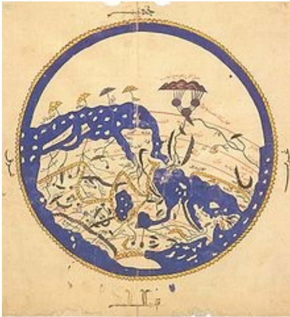
Introductory summary overview map from al-Idrisi's 1154 world atlas. Note that south is at the top of the map.